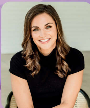
PAULA FARIS FORMER GOOD MORNING AMERICA ANCHOR